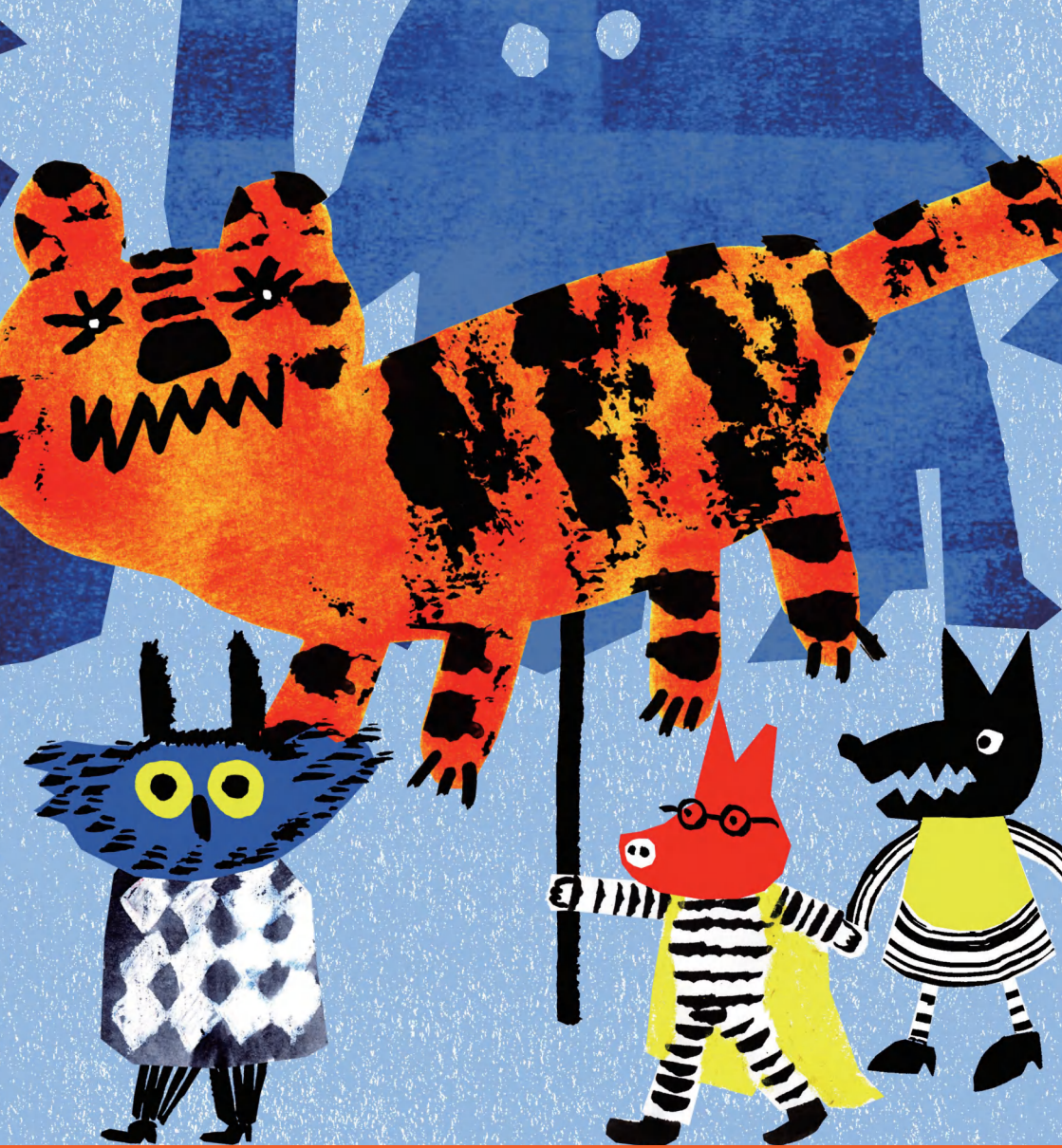
Illustration courtesy of Yuliya Gwilym, 2021 Golden Pinwheel Young Illustrators Competition Astra Award winner